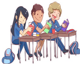
The school earns Scholastic Rewards.