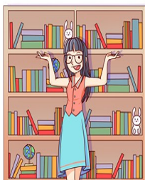
The school redeems Scholastic Rewards for additional resources