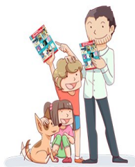
Families order from Book Club.

Every purchase you make earns your child's school 15% of your order value in Scholastic Rewards that can be used to purchase valuable educational resources that benefit your child.